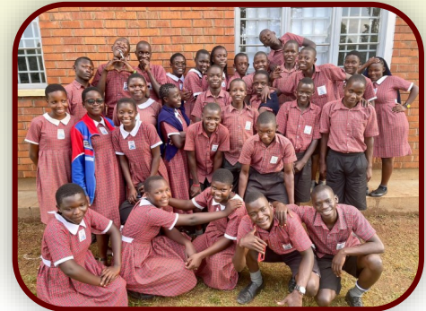
Our proud 2023 Genesis graduates

I am thankful to God for all the supporters of this ministry that make this possible. It is always amazing to me to see how the ministry has flourished because of Jesus. Seeing the children falling in love with Him makes everything that we do, even when it is difficult, worth it all. I give all praise to our God.