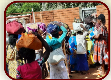
Food distribution from our offsite storage location

We are grateful to have received the first $100,000 for this facility and would like to raise the remaining estimated $50,000 needed in 2022.